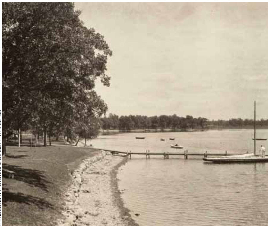
ABOVE: Just as it did more than a century ago, Lake Lawn's shoreline spans approximately two miles.

2011 summer season. Former employees were given hiring preference and more than half returned. They weren't the