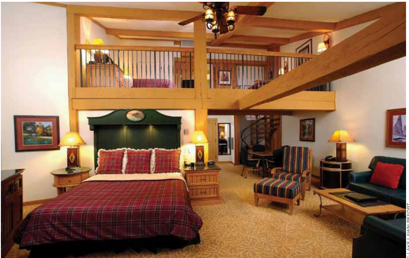
ABOVE: Recently updated rooms feature handcrafted wood furniture, rich fabrics and a private outdoor patio or balcony.

In mid-January, he said he began to seriously explore what it would take to buy the resort. He called people he thought might be interested. He researched the resort industry. He questioned his own motivation: Was he simply bored in retirement or was